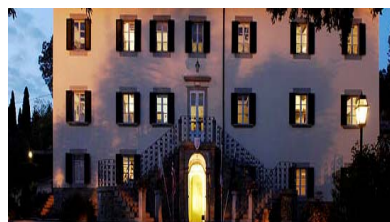
Villa Aurea, Cortona