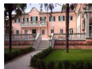
Villa Zucari, Montefalco

If you are an HSBC Premier customer and enjoy escaping the tourist spots, want to mix with the locals, indulge in great regional food and wine, stay in charming authentic accommodation, and in short, have the trip of a lifetime – then join Annabelle White, New Zealand's favourite cooking personality, for an enchanting tour of the Italian countryside by Vespa.